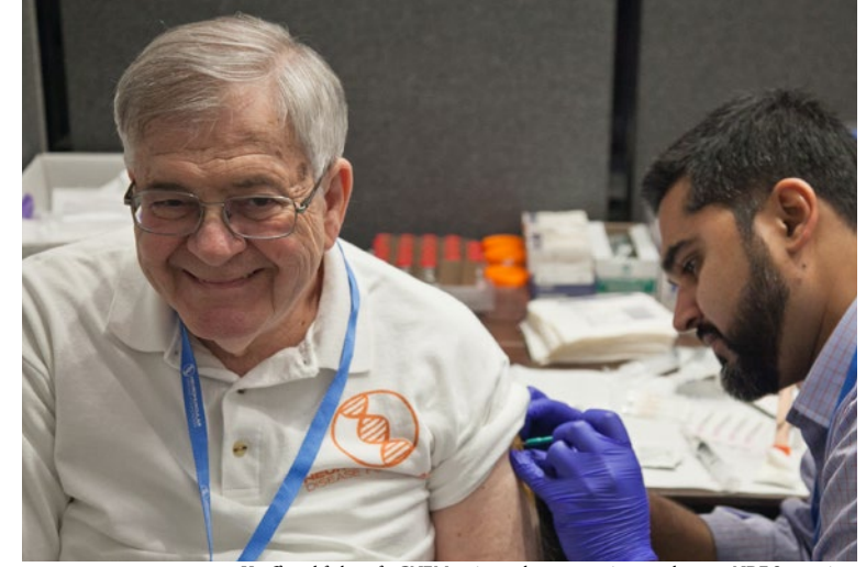
Unaffected father of a GNEM patient volunteers to give samples at an NDF Symposium

with special guest, Dr. Gretchen Kubacky