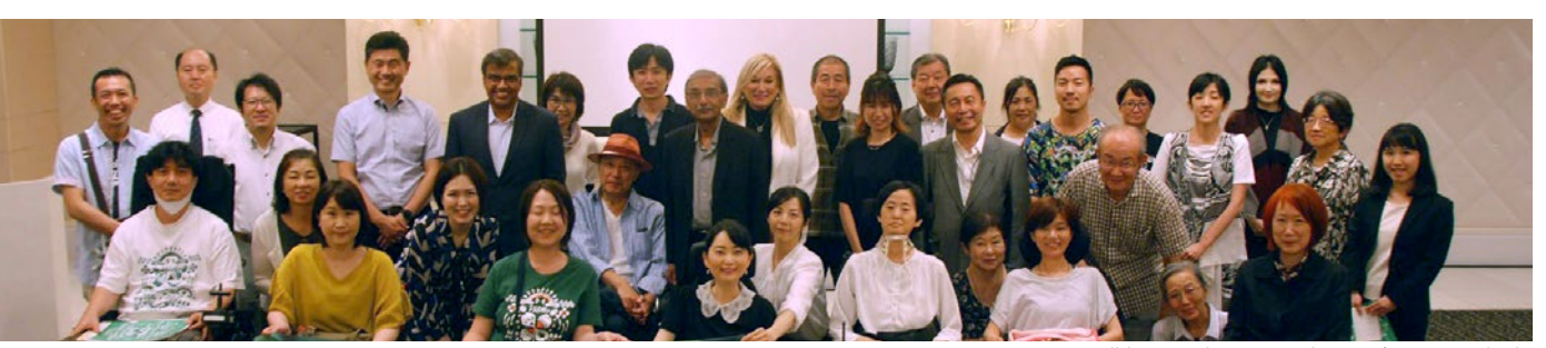
NDF collaborates with scientists and patients from Japan and India